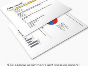
(Few sample assignments and question papers)